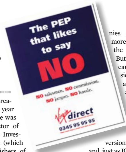
Virgin's Pep was hit in the dotcom crash

He got out in March, investing the money he'd made from compa-