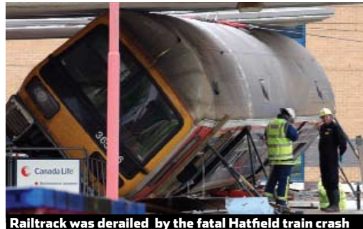
Railtrack was derailed by the fatal Hatfield train crash

relations and lobbying company he'd just founded was a low-cost online fund supermarket selling direct to investors. The shelves were stacked with actively managed funds.