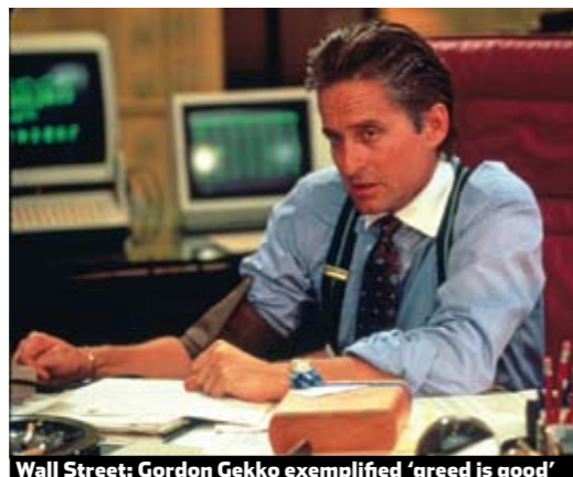
Wall Street: Gordon Gekko exemplified 'greed is good'